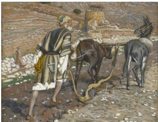
Looking Back—The Man at the Plough James Tissot (1836-1902)